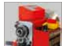
S/N: 10062 For mini Lathe C2