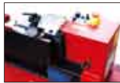
No more High/Low Gear Trouble Free