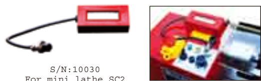
S/N:10030 For mini lathe SC2