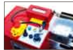
Digital Spindle Speed Readout Available (Optional) S/N: 10030