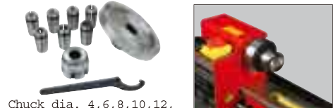
Chuck dia. 4,6,8,10,12, 14,16mm